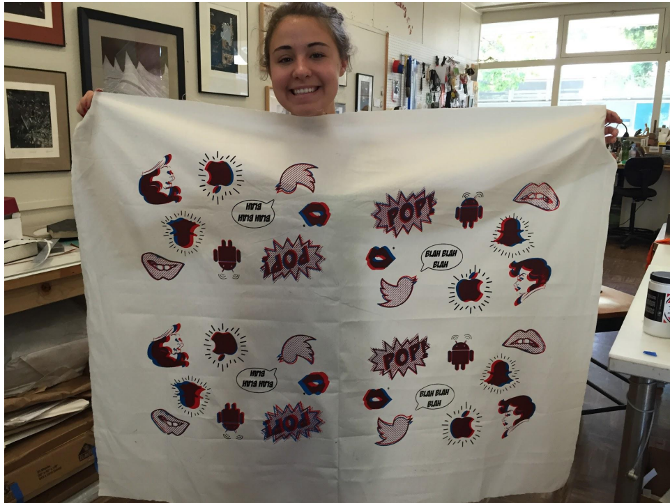
Screenprinted fabric (later made into skirt)