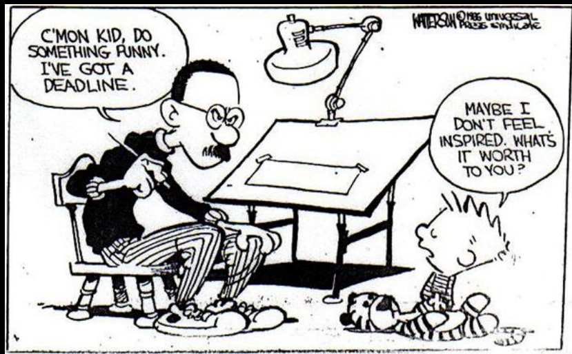
Cartoonist Bill Watterson, creator of the comic strips Calvin and Hobbes