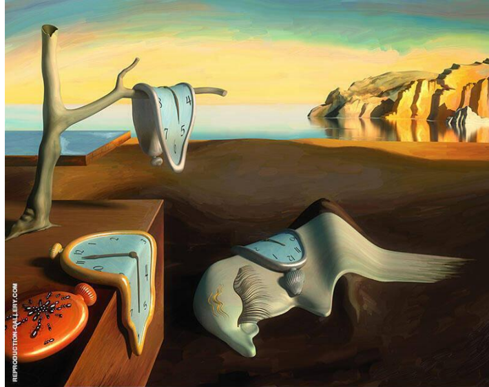
Salvador Dali, The Persistence of Memory , 1931

Where The Great Masturbator and Dream Caused by The Flight of a Bee Around a Pomegranate a Second Before Awakening tackle emotion, The Persistence of Memory describes exactly that, memory. Dalí's most famous piece depicts drooping clocks on what seems to be a beach. Objects sit on the sands that don't belong or are unrecognizable, such as the white blanket-like object on the ground or the metallic, shiny slab behind the branch. The water is smooth and still, completely uncharacteristic of the ocean, not a single wave breaks shore. This piece illustrates Sonny's argument, as the ideas of memory and the surrealism of it all could represent feelings in the soul, the infinite. These characteristics, I believe, are used to give a depiction of memory and as vivid as some memories can get, they will eventually fade, become lost to time, as shown by the clocks. As Sonny says perfectly, "We're not here to live forever. Humans and materialism die. But there's no dying in art."