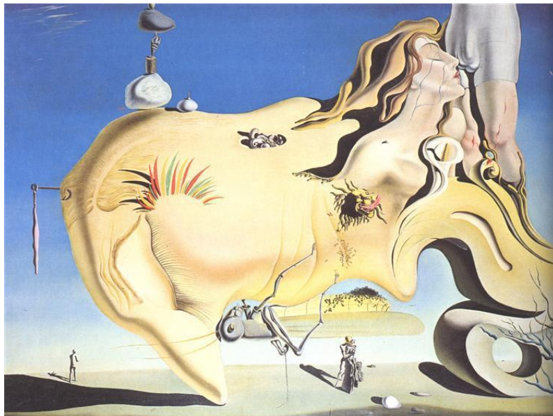
Salvador Dali, The Great Masturbator , 1929

Sonny's argument has been shown in some of Salvador Dali's surreal works. Pieces such as The Persistence of Memory (1931), Dream Caused by The Flight of a Bee Around a Pomegranate a Second Before Awakening (1944), and The Great Masturbator (1929). These works express pure emotion, one that comes from within that words couldn't express, emotion that Sonny speaks of.