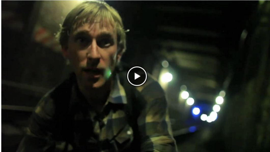
Undercity: New York City Urban Exploration